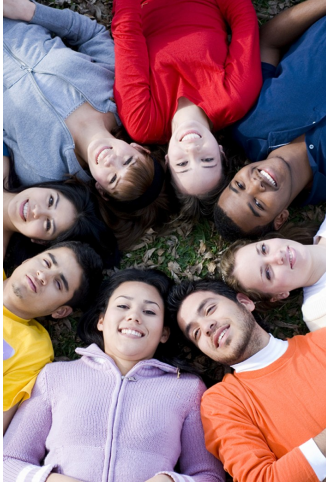
More heads are better than one...

“The Pathways Project has the potential to create, in Houston, a vision that can be shared in communities across the nation.”